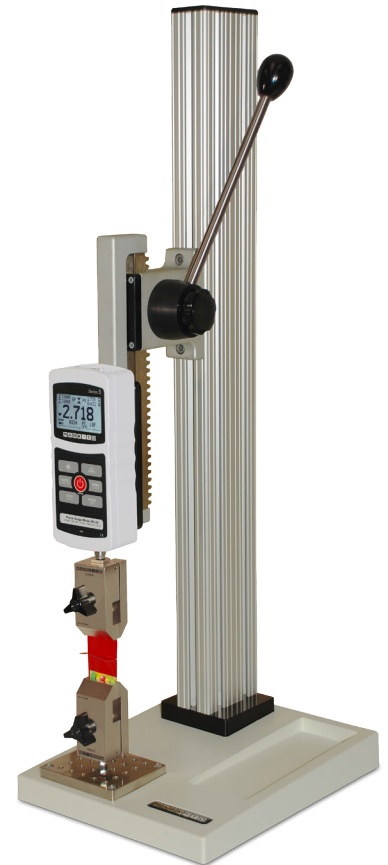
The TSB100 is shown with a Series 5 force gauge