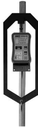
Compression Cage - Applies Compression Weight to Inverted Force Gage