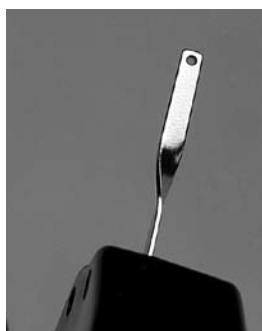
Detail of Flat Tip