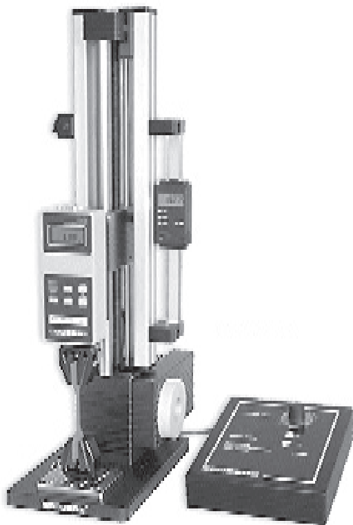
ESM shown with Mark 10 force gage (sold separately)