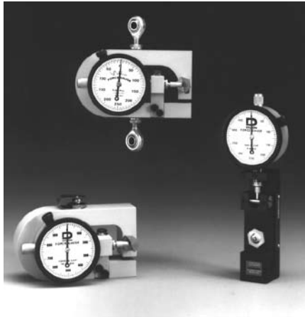
Dillon Gages; X-C, X-PP and U gage

The three versions of the Dillon Model X Gage Series measure compression, tension and push-pull forces in a wide range of capacities to 50,000 pounds . The "D" shaped deflection spring constructed from high strength aluminum with higher ranges in alloy steel is the heart of the Model X force gage. The easily read dial may be equipped with an optional shockless dial indicator for tests that involve the sudden application or release of force.